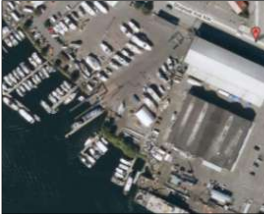
Seaview Boatyard Ballard, Wash.